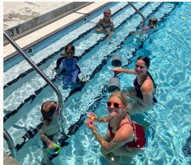
Aquatics Program Participants

Measure D-20 funding helped keep costs manageable for families while restoring a valued recreation program that builds confidence in the water, encourages active lifestyles, and provides fun, quality time together for residents of all ages.